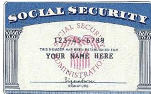
Social Security Card